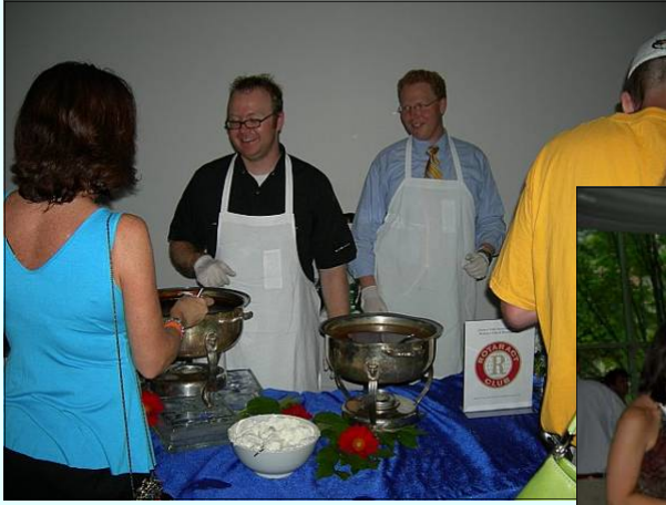
Art on the Rocks Dessert Table July 21, 2006